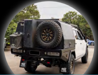
Multiple rear wall configurations