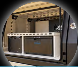
Inbuilt drawer fridges/ Upright fridges