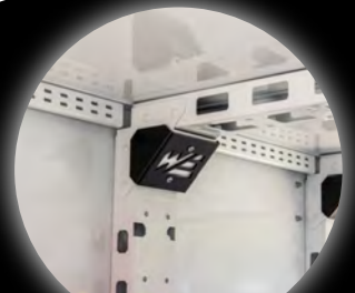
Industry leading bracing