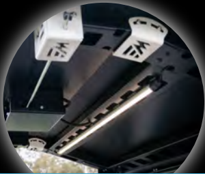
Lighting & central locking