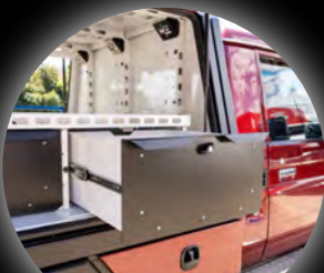
Drawer storage options