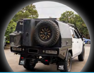
Multiple rear wall configurations